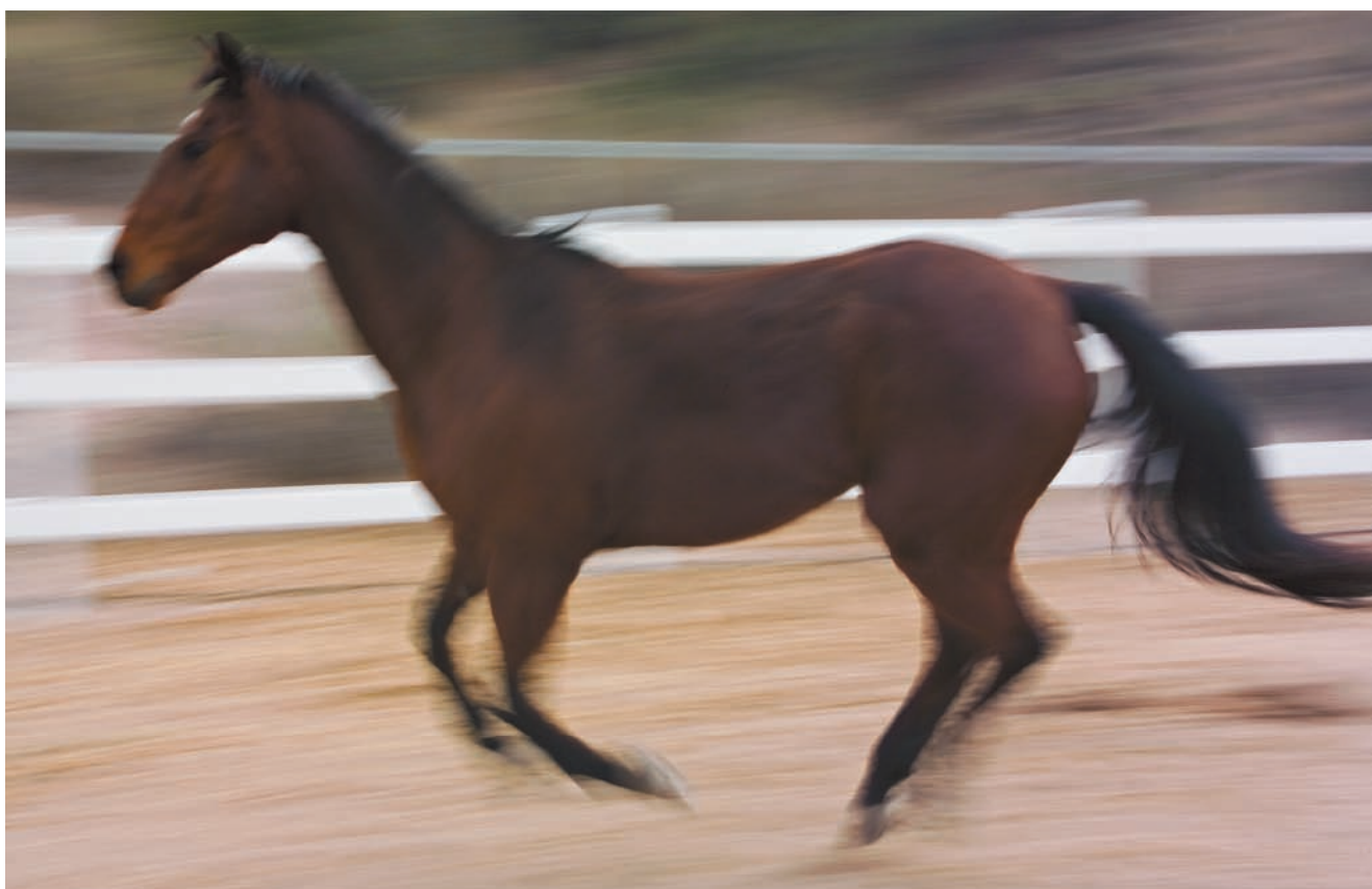
Figure 1. The mixture of sharp and blur in this image is caused by using strobes with a long shutter speed (called dragging the shutter). This was made at 1/20 second and f/19 at ISO 100. The strobe is a Norman 200B.

S yncing your strobes (or flashes) to your camera has its share of difficulties. Problems include broken cords, misfires, and, if you choose too fast of a shutter speed, an exposure that is only partially illuminated by your flash. But when flash syncing works (Figure 1), you control light. For a photographer, that's an essential power to have.