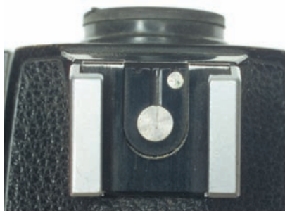
Figure 5. The hot shoe of a Nikon FE. More modern cameras have additional contacts.