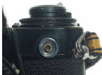
Figure 6. This is the camera PC connection.