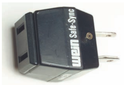
Figure 3. The Wein Safe Sync prevents high voltages from damaging your camera.

can use without having part of the image unaffected by the flash is called the sync speed. A few camera manufacturers make strobes that flash repeatedly, allowing syncing at higher shutter speeds—the extra flashes allow the shutter to completely travel over the sensor while light from the strobe is present. The nice thing about this high-speed sync is not stopping action, but reducing existing light in a shot. This gives you more control over the balance between daylight and strobe (called flash fill). Currently, Canon, Nikon, Pentax, and Olympus have that feature on some, not all, of their camera bodies. For it to work, you must have both a camera body and flash that are built for that feature, which is generally referred to as FP flash. This mode reduces the power of the strobe substantially: at \frac{1}{250} second the power is down to 25% on one unit I checked. At \frac{1}{500} th you have only about 12% of your original power.