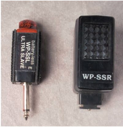
Figure 11. This is an infrared-slave set. The transmitter fits on the camera hot shoe. Unfortunately they take a long time to recycle.