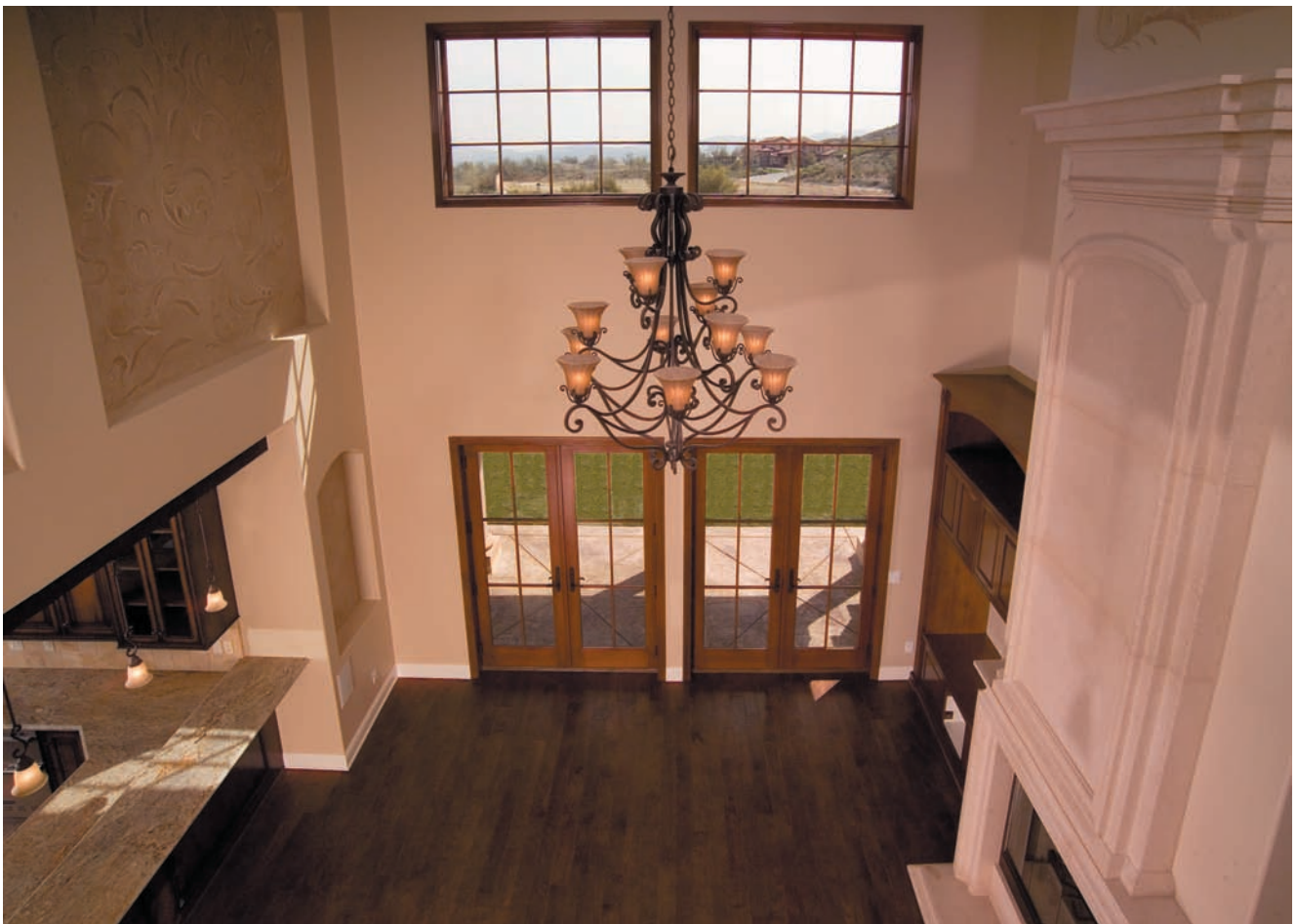
Figure 13. This shot of a large home required four strobes in different places to go off at the same time. That was achieved with optical slaves.

couldn't have done it without optical slaves.